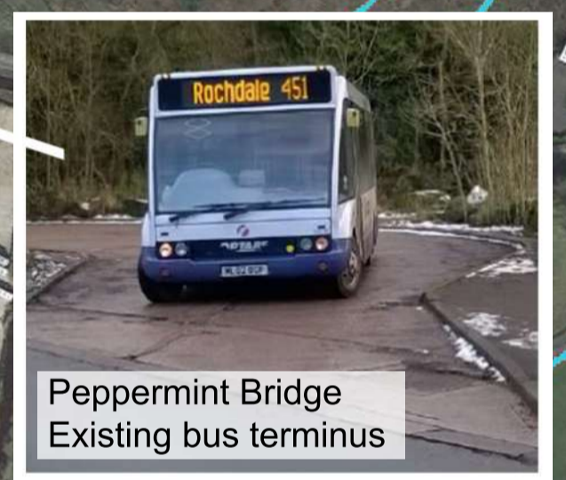
Peppermint Bridge Existing bus terminus