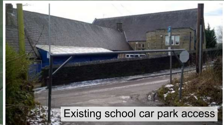
Existing school car park access