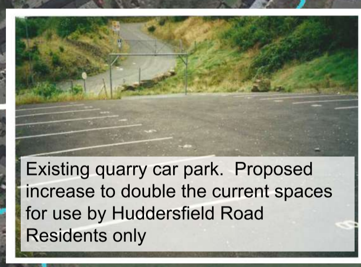
Existing quarry car park. Proposed increase to double the current spaces for use by Huddersfield Road Residents only