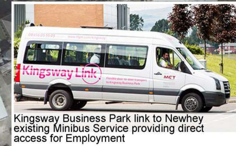
Kingsway Business Park link to Newhey existing Minibus Service providing direct access for Employment