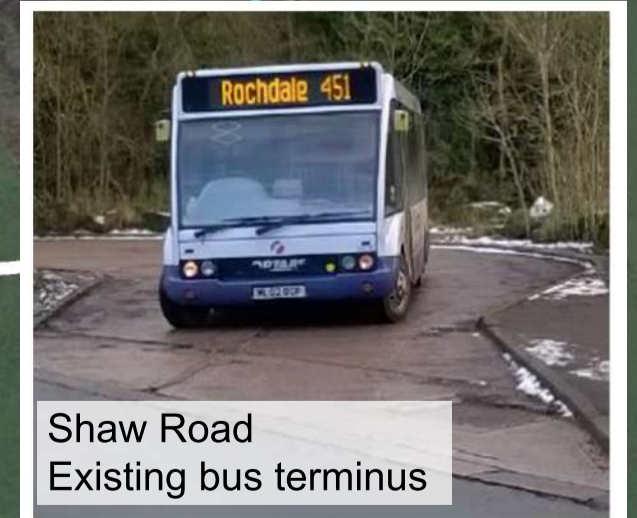
Shaw Road Existing bus terminus