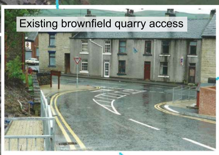
Existing brownfield quarry access