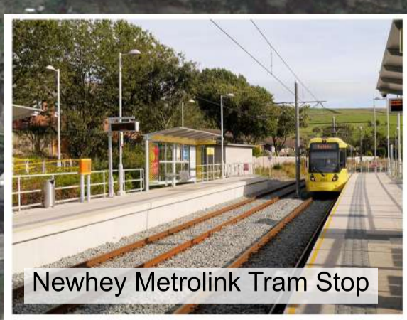
Newhey Metrolink Tram Stop